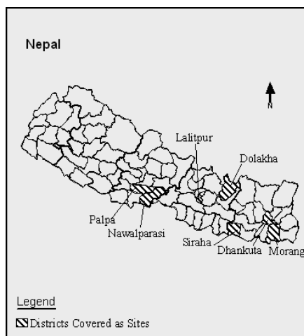
Figure 1 Districts belonging to the sites

Gagan Khola CFUG is located in Siraha District of the Eastern Terai Region of Nepal. One of the reasons for interest in this CFUG was that it has received a prestigious conservation award (Ganeshman Vatabaran Samrachhan Puraskar) in 1998. However, dalits of the CFUG were economically and socio-culturally suffering from the actions taken by the higher castes and economically advantaged members of the community. We referred to the process applied in the CFUG as "Self-Monitoring" and this approach was applied during the period of 2003-2004.